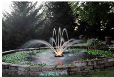
CONDOR 4' x 4' Inner & 2' x 10' Outer Tier Arch's