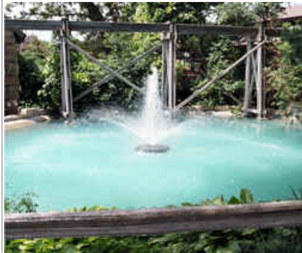
Linden 6.5' x 3' Inner & 3.5' x 20" Outer Tier