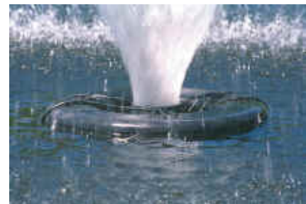
Includes mounting ropes

¼ to 1 hp: Two Year Warranty 2 to 7½ hp: Three Year Warranty