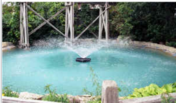
Juniper 3' Tall x 20' Wide "V"