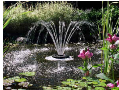
OSPREY 3.5' Tall x 7' Wide Arch