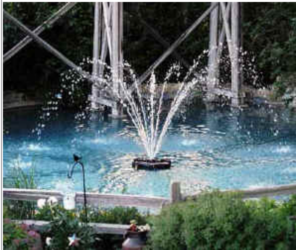
Cypress 6' Tall x 16' Wide Arch