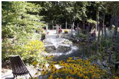
HAWK'S NEST 3' Tall x 7' Wide Small "V"