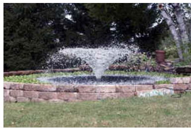
EAGLE'S NEST 3.5' Tall x 10' Wide Large "V"