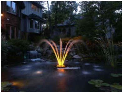
OPTIONAL LED LIGHTING