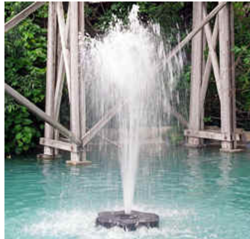
Sequoia 7' Tall x 4' Wide Geyser