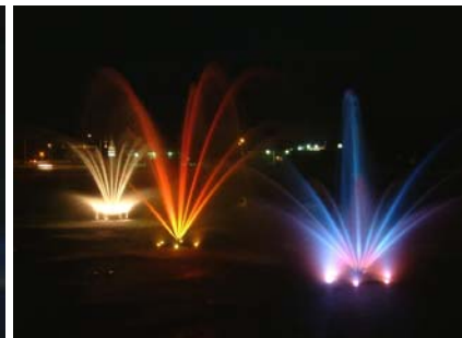
Brass High-Intensity Underwater Fixture 2x75W or 3x75W

The use of wet/dry listed fixtures allows the fixtures to be mounted right at the waterline. This produces maximum brightness by eliminating absorption through a layer of water.