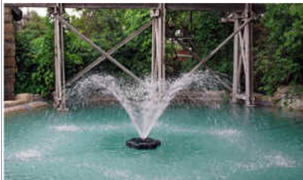
Willow 4.5' Tall x 15' Wide "V"