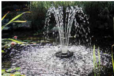
FALCON 4' Tall x 4' Wide Narrow Arch